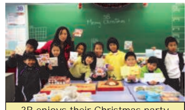
3B enjoys their Christmas party

different foods, such as curry fish balls, salad and sushi. They were delicious. Then, they played games. The games helped to teach