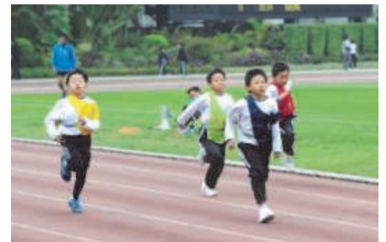
P.3 students running 100m

There were many different competitions for P.3-P.6 to join. There was 60m, 100m, 200m and 400m for running. There was also long jump, high jump, shot put and running relays.