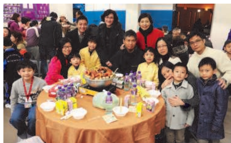
Everyone enjoyed the Poon Choi party together

If there is a Poon Choi party next year, you may try the Poon Choi too!