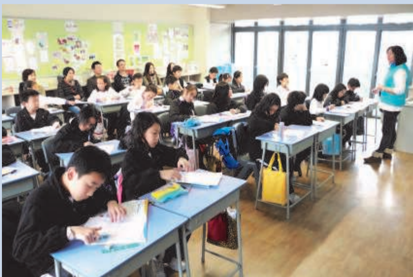
The parents watch class 5A study English

All of the students worked hard to show their parents what they learn at school. Everyone tried their best. Valerie Chiu from 2B said, "It was fun. The students in 2B were very patient and well behaved."