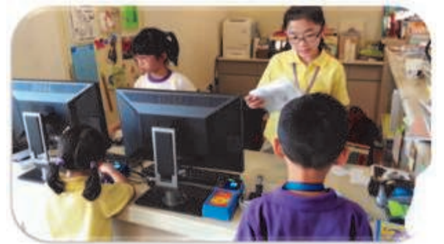
The librarians work very hard at the library