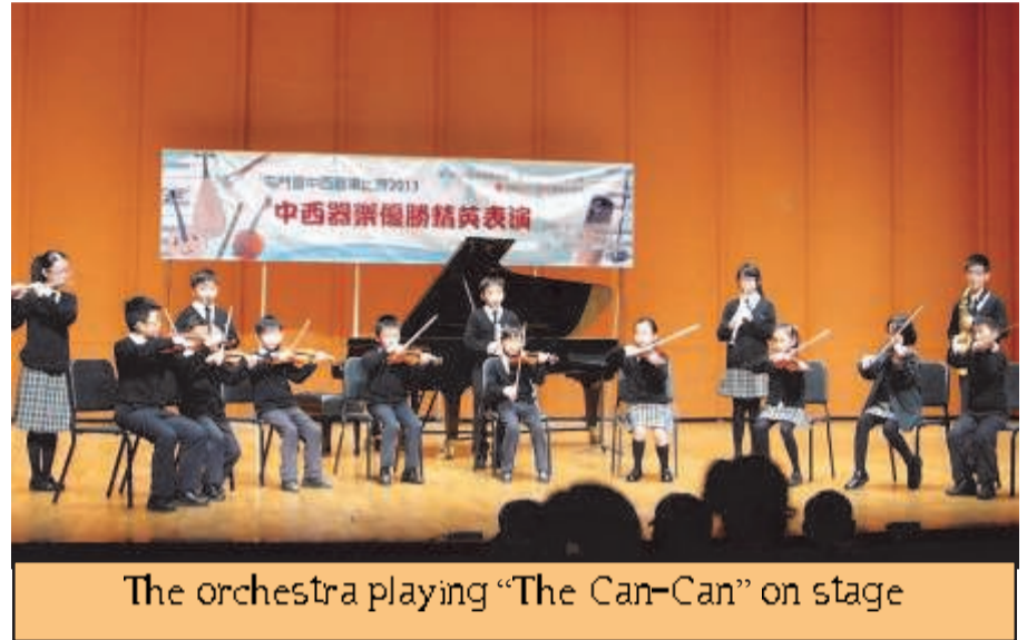
The orchestra playing “The Can-Can” on stage

Any student at Lee Kam Primary School is able to join the orchestra. We hope they will do well in their next competition!