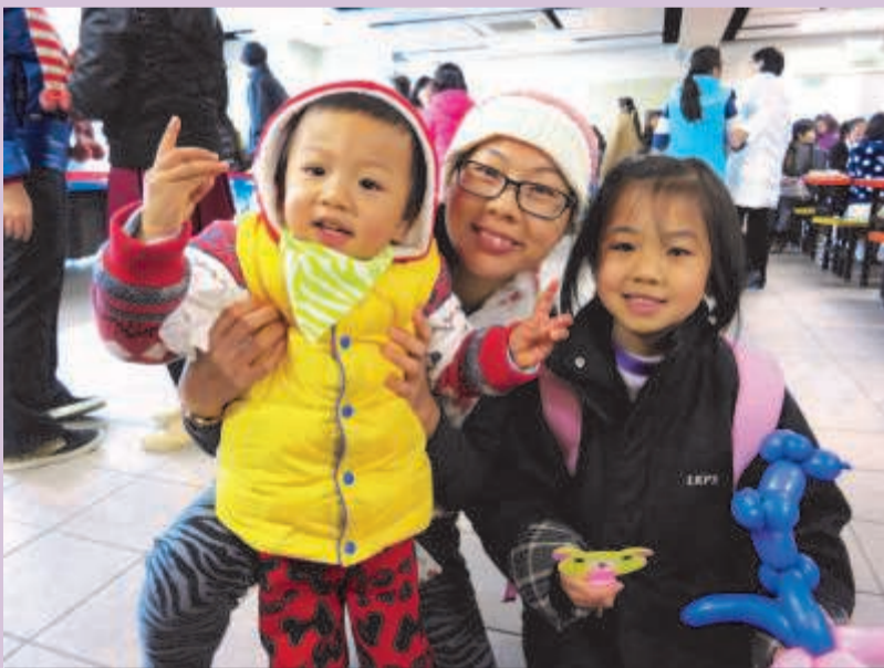
Kindergarten students came to the Open Day

The students hope that there will be more fun games at the next Open Day and that more children will come to see their school.