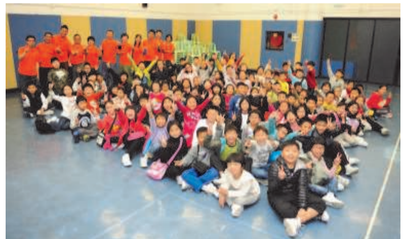
P.4 students went to Tso Kung Tam