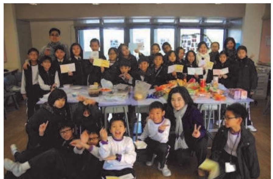
Class 5C having a good time with their teachers

The students hope next year’s party will have more special events and be even more fun!