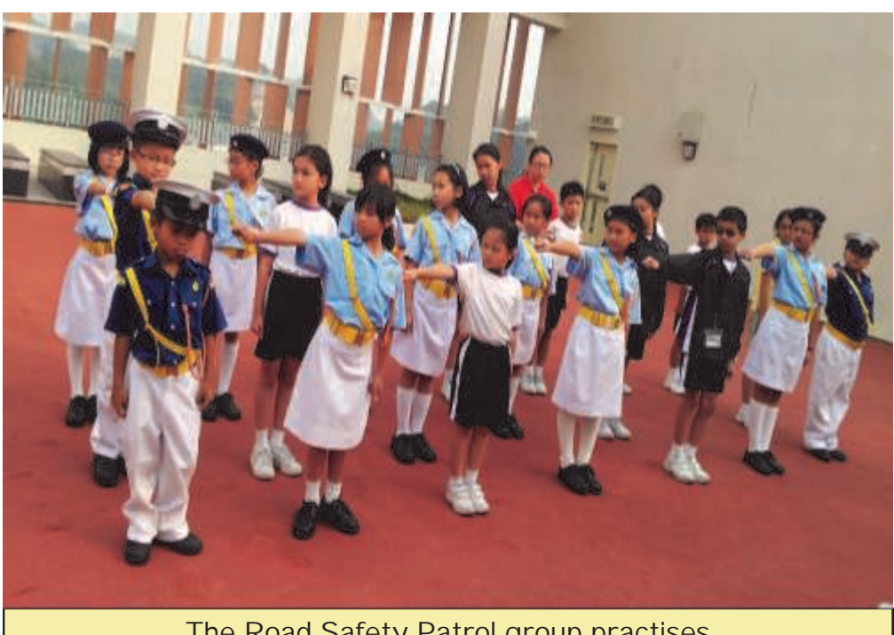
The Road Safety Patrol group practises

The students in the Road Safety Patrol meet every Monday after school for one hour. There are about 50 students in the group and they need to wear the Road Safety Patrol's uniform.