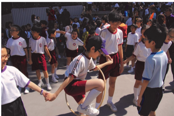
Students play the hula hoop game.

When everyone got there, they took a photo. Then, the students followed the teachers to the big playground that looked like a football field. They all ate something and took a rest there. In the afternoon, they