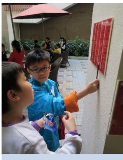
Students are working together to solve riddles.

P.4 went to the Hong Kong Baptist Assembly camp in Fanling, P.5 went to the Jockey Club Tai Tong Holiday Camp, and P.6 went to Pak Tam Chung Holiday Camp in Sai Kung.