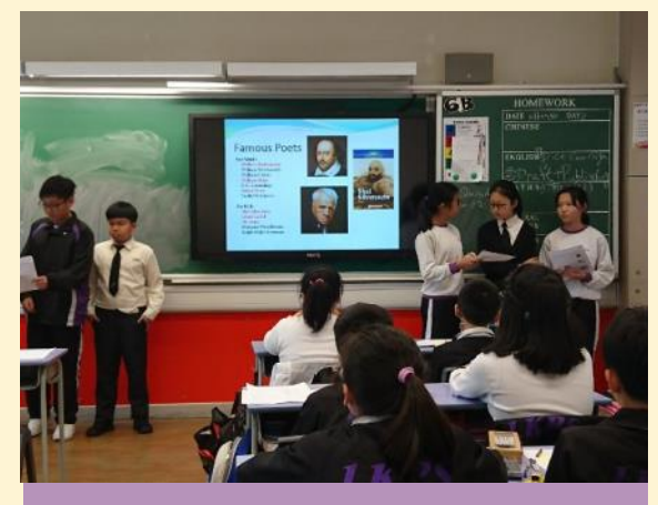
The students are presenting about different genres in class 6B.

he students and teachers of Lee Kam Primary School were glad to have the English Reading Month. Both students and teachers may read English