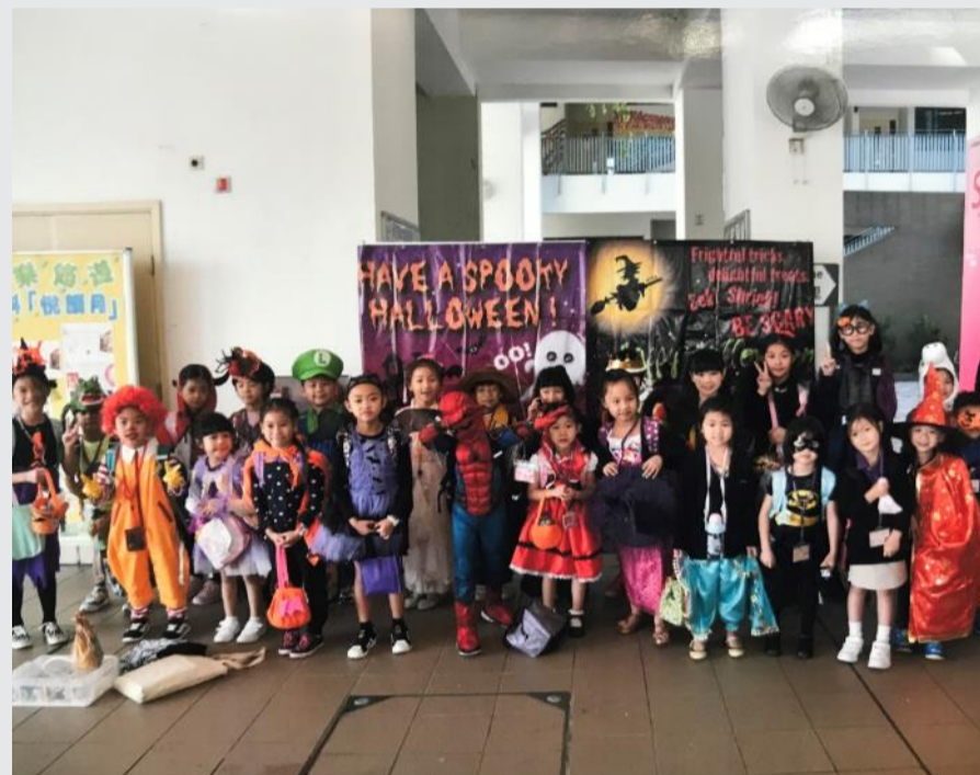
Students gather at the Halloween party.

Students exchanged candies like gummies, lollipops, chocolate and chewing gum during recess. They loved their candies! Some students got a big bag of candies. Ellie from 4D said that she thought the Halloween party was interesting.