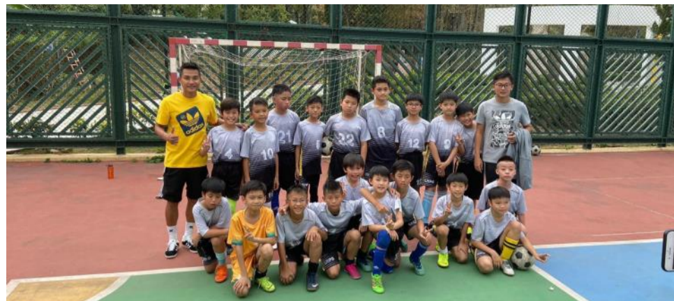
The football team at practice