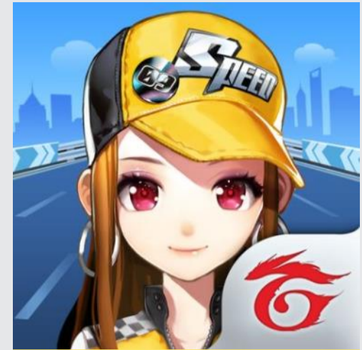
Garena Speed Racers Logo

While this game is the trend of the year, only time will tell whether it will last in the future. There may be a different game next year!