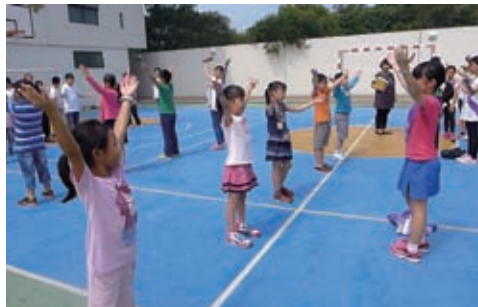
Students sing “Song of the month” together every month.

The school maintains an authentic English and Putonghua language environment as a goal to help our students to “listen more, speak more and read more” in English and Putonghua.