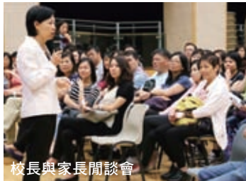
校長與家長間談會