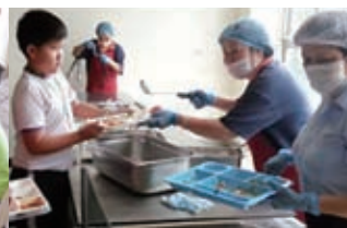
English Everywhere – Speak English in Canteen