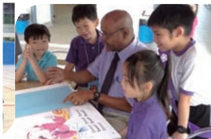
Students read stories together during recess.