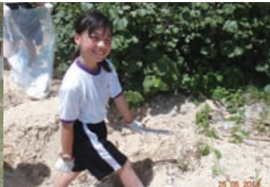
愛自然行動清潔沙灘