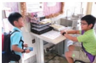
English Everywhere – Talk to Prefect