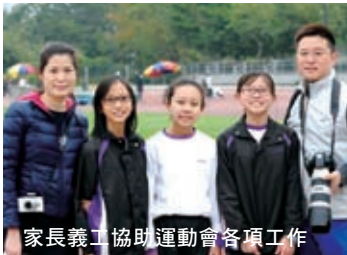
家長義工協助運動會各項工作