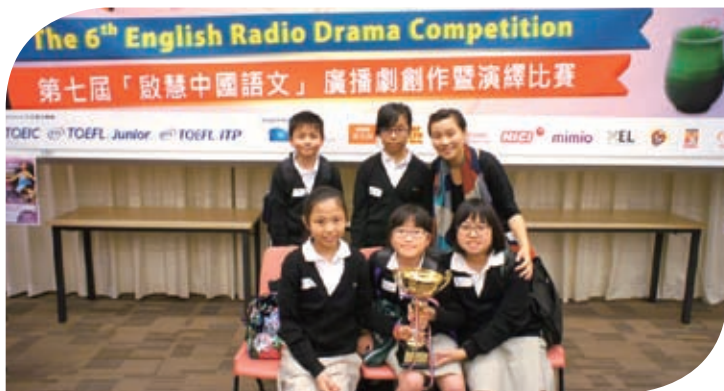
Our Banana Drama Team won the 6th Interschool English Radio Drama Competition Gold Award