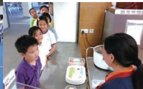
English Everywhere – Super Snack Shop