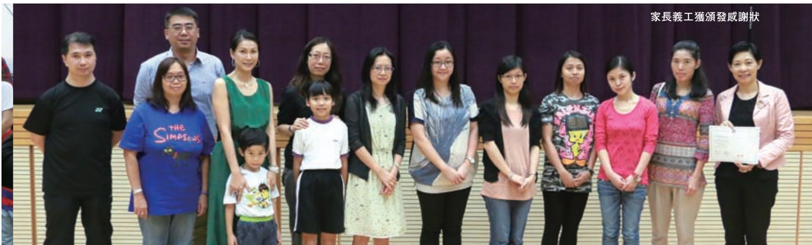
家長義工獲頒發感謝狀

We love to learn. We learn to love. We are SUPER.