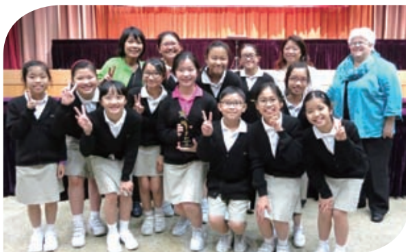
第九屆香港手鈴節小學手鈴初級組冠軍