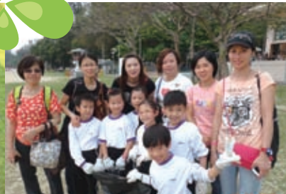
國際海岸清潔沙灘親子活動