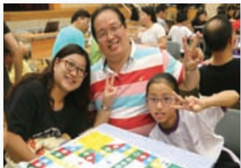
■親子飛行棋王大賽

The school puts great effort in building good partnership with parents. The PTA of the school helps strengthen the connection between the school and their students' families. Our parent volunteers are devoted to participating in different home-and-school activities so that a strong sense of belonging is created among our students.