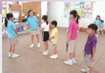
■ English Buddies於小息時請同學以英語作為溝通媒介購買小食