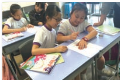
■二人小組分享所學

The school emphasizes teaching to students' needs and puts focus on students' learning participation in the classroom. The school has implemented SUPER classroom rules in every class for a systematic disciplined learning environment and uses various teaching strategies and plans to enhance students' learning. Teachers use interactive teacher and peer to peer interaction to allow students to fully grasp learning objectives.