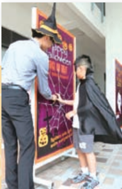
■ Halloween activity

The school maintains an authentic English and Putonghua language environment with the goal to help our students to “listen more, speak more” in English and Putonghua to allow students to communicate comfortably in a trilingual setting.