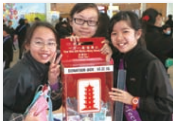
■環保為公益捐款活動