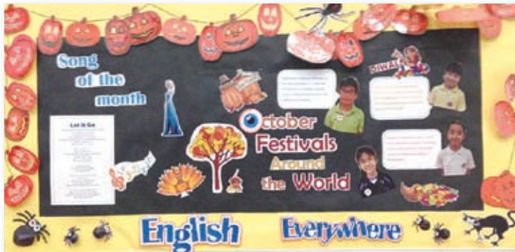
■ English Everywhere 展板，增加學生沉浸於英語語境的機會