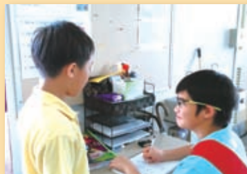
■ 風紀同學以英語與同學交談