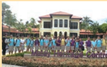
■ 新加坡手鈴學習交流