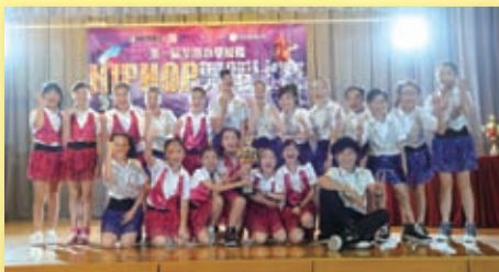
■ 本校Hip Hop舞隊參加第一屆全港小學校際Hip Hop舞蹈比賽，奪得最高等級的甲級榮譽獎。