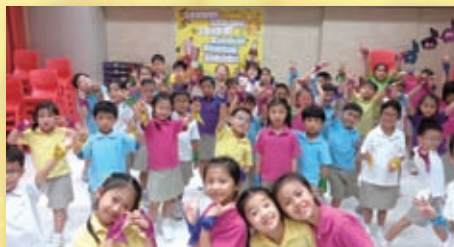
■ 每年一度的成果分享晚會讓學生展示在課外活動的成就。