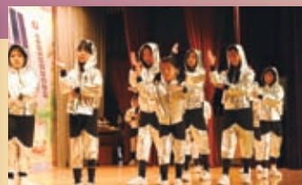
Hip Hop 舞隊