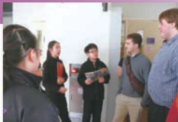
■ Hartwick College 學生訪校本校的 English Buddies負責接待