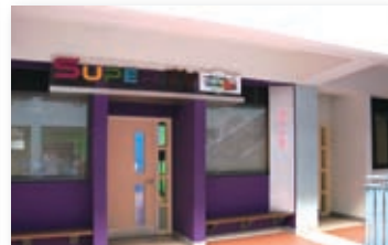
■ SUPER TV 校園電視台