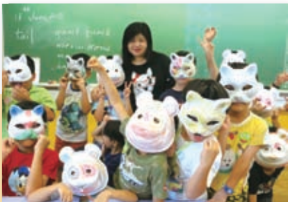
■ Animals English Day