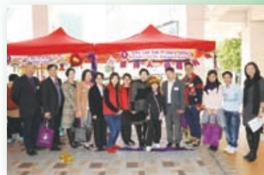
本校與屬會譚伯羽中學、梁鈺琚中學及屯門梁李秀娛幼稚園合辦嘉年華會暨參觀日