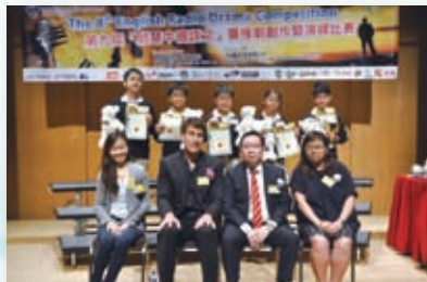
Drama C隊在The 8th English Radio Drama Competition榮獲The Second Place Silver Award。