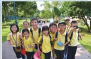
全方位學習日——樹木之旅