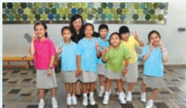
教師親切，關懷學生，與學生關係良好