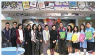
數學科創設學習圈與其他學校進行觀課交流

本年度數學科推出教師學習圈專業發展計劃，促進本校數學科老師的專業成長。數學科卓越表現更獲香港大學教育學院莫雅慈博士推薦參加在德國漢堡2016年第13屆國際數學教育大會向來自世界各地數學專家、教授、教師分享本校數學科學習圈教師專業發展的計劃與成果。