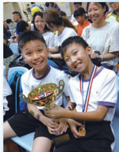
羽毛球隊奪得屯門區校際羽毛球男子組團體冠軍及女子組團體亞軍。