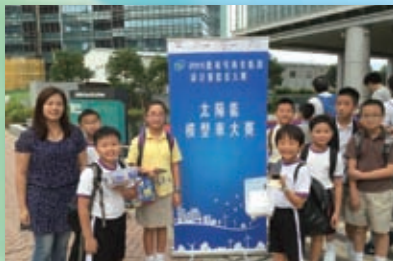
探究小先鋒參加「2015應用可再生能源設計暨競技大賽 - 太陽能模型車大賽」，從86隊參賽隊伍中脫穎而出，獲得了亞軍。