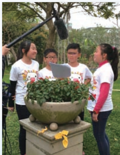
四位六年級同學參加了翡翠台兒童節目「Think Big 遊學團」之拍攝，親身體驗農夫的一天。