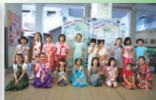
English Day – All Around the World