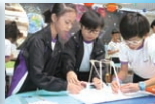
常識科探究式科學實驗活動