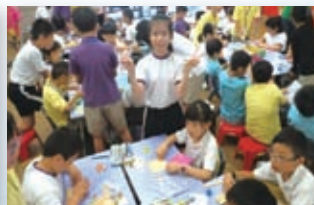
P5 English Project – Photo-framing with P2s