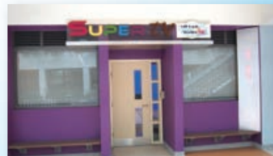
SUPER TV 校園電視台