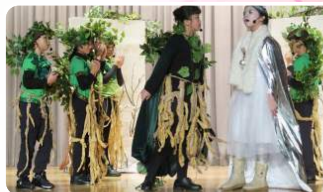
英語話劇組在本年度話劇比賽榮獲多項獎項