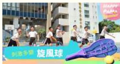
明報《HAPPY PAMA》於2018年6月介紹本校開辦的旋風球班