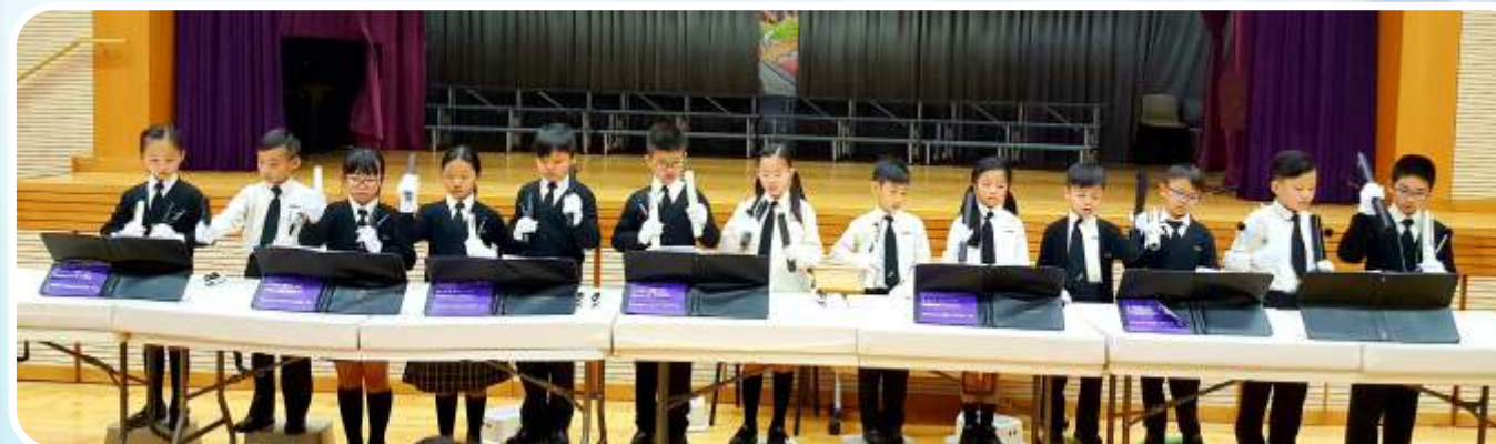
手鐘初班同學在聯校音樂大賽2018中奪得金獎