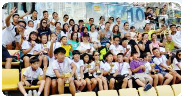
泳隊在學屆游泳比賽中奪得了多個團體獎項