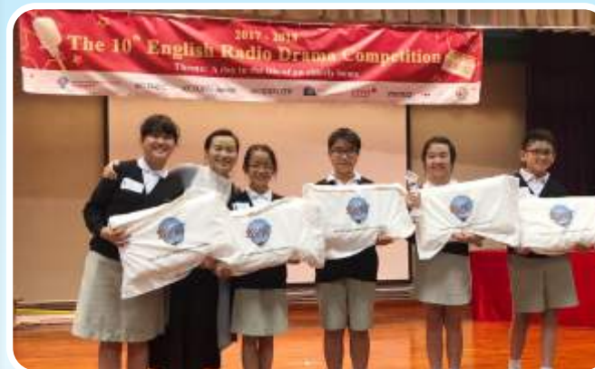
英語話劇組在《English Radio Drama Competition》 中奪得金獎